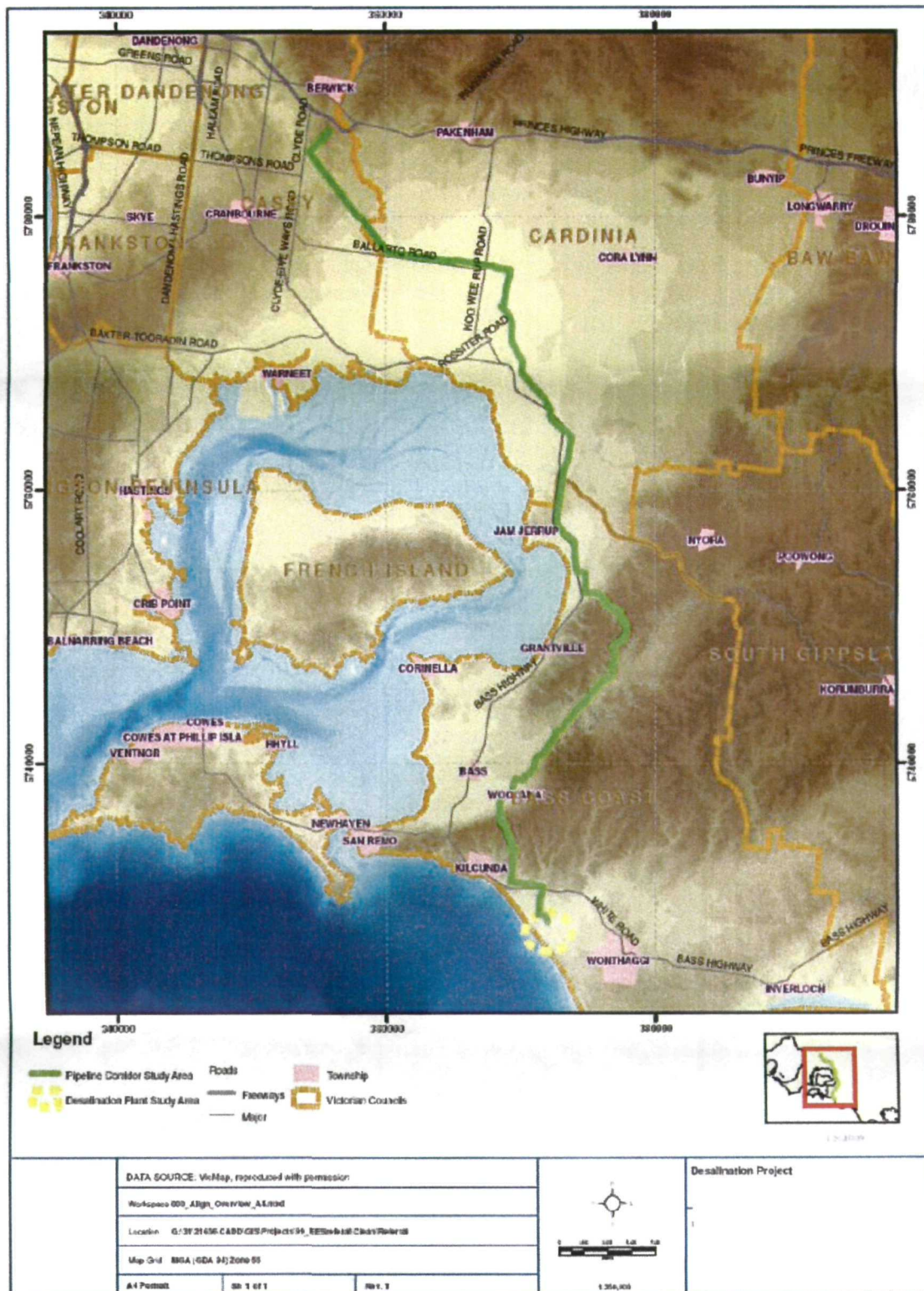
Figure 1 General location of the Desalination Plant and Transfer Pipeline