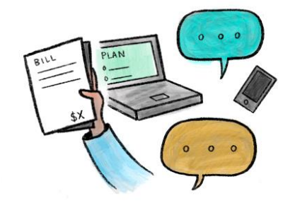
Recommendation 5: ESC to work directly with consumers, and in partnership with other organisations, to help and educate consumers to become more aware of their rights, entitlements and obligations so that they are confident and empowered to understand, act and navigate the system with positive outcomes.

Recommendation 1: ESC must work with providers to ensure bills, forms and communications are understandable, inclusive and accessible for all Victorian consumers and are tested with a diverse group of people experiencing hardship. Methods of communication must be driven by the consumer, not the provider.