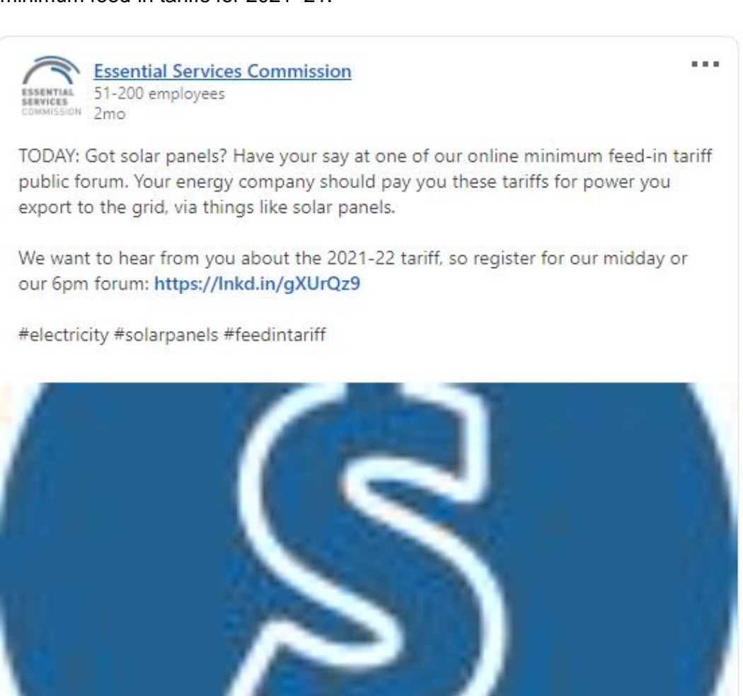
Minimum feed-in tariff review 2021-22

We used LinkedIn and Twitter to share information with you on how to have your say on the minimum feed-in tariffs for 2021–21.